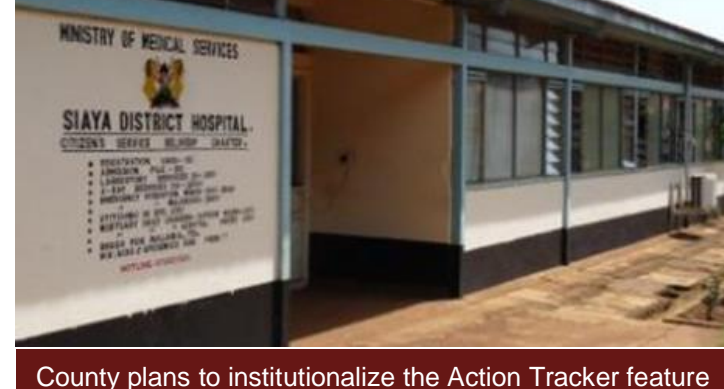
County plans to institutionalize the Action Tracker feature on the Scorecard Web Platform

ensuring HFs with KEPI fridges immunize daily, equipping 17 additional immunizing sites with KEPI fridges, and conducting regular monthly outreaches